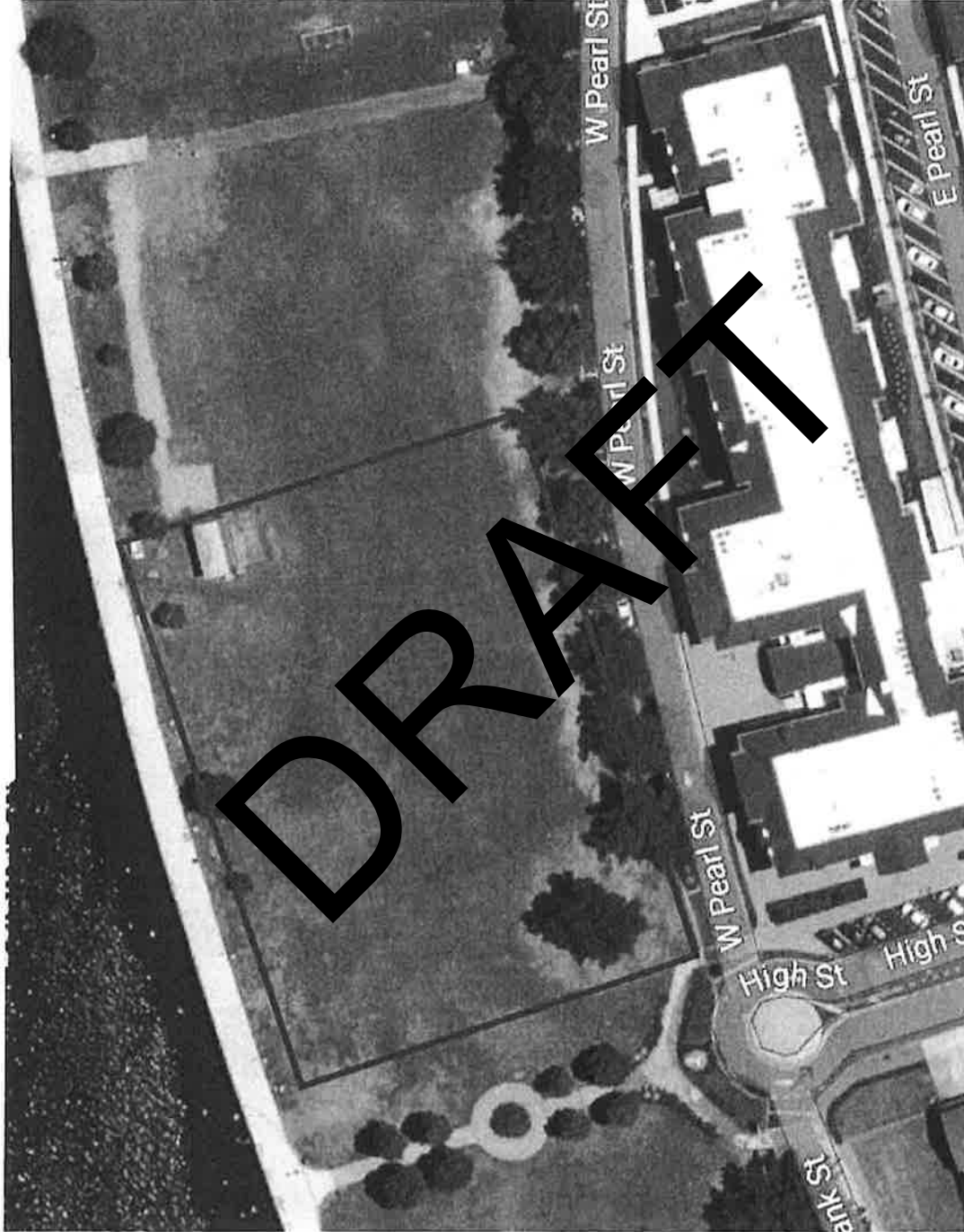
Figure 1- Proposed Open Container Area